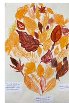
Year 1 artwork

Thank you for your generous donations to our Harvest Festival collective worship. The food will be distributed to local people in need, in partnership with the Church.